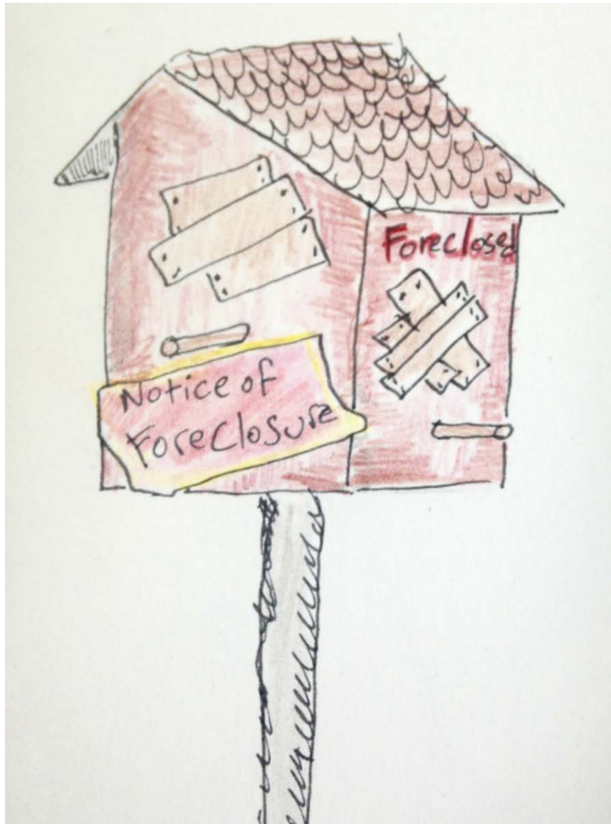
Aaron Schraeter, Birdhouse Repo (rendering of proposed artwork)